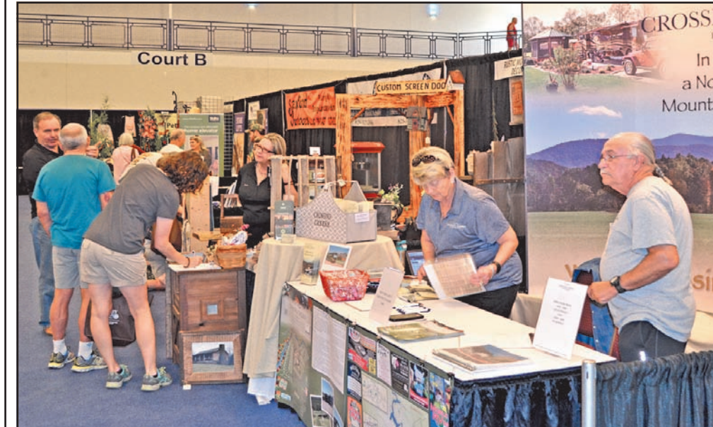
The 2017 Home & Garden Show.