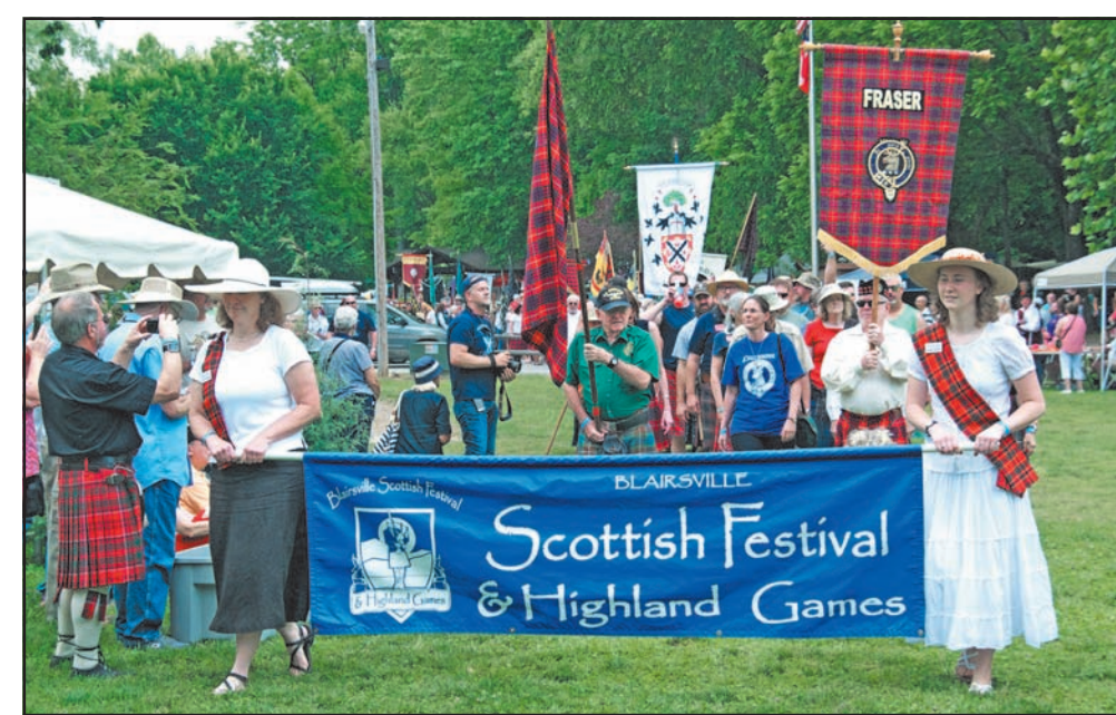
Clan Fraser was the honored clan at the 2017 Blairsville Scottish Festival & Highland Games.