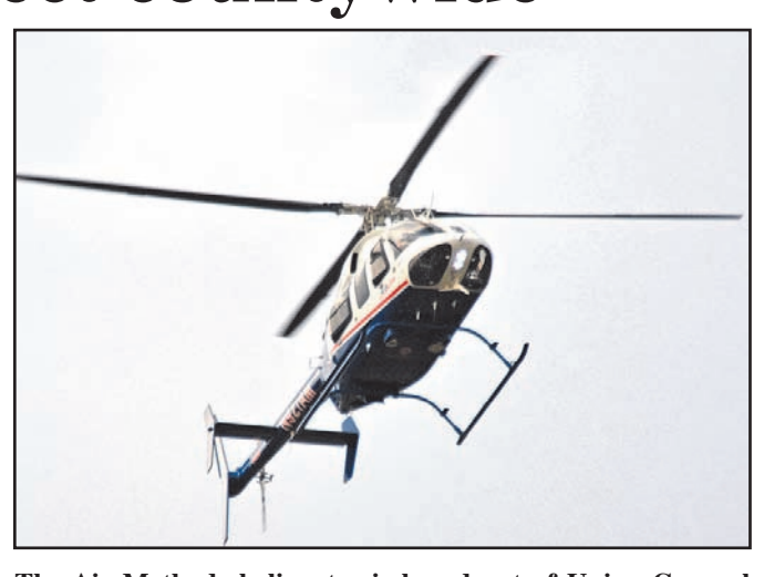
The Air Methods helicopter is based out of Union General Hospital in Blairsville.

This blanket membership for all county residents includes everyone who lives in or has a See Ambulance, Page 3A